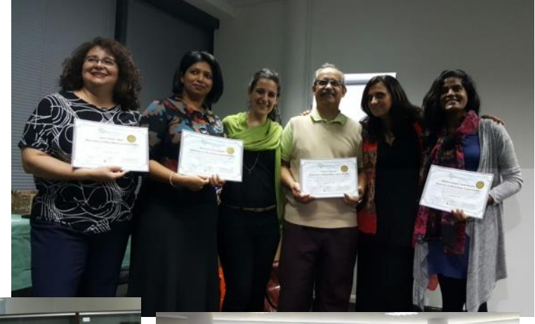
Snapshot of the MCF Meeting on 11 June 2016

I am equally impressed with the MCF Members for the consistent high turn out of the Monthly Practice sessions. We have held 15 meetings since we started the MCF and every single one has been well attended.